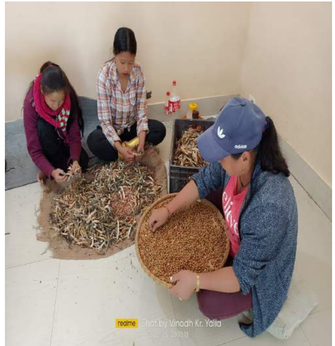
realme Shot by Vinodh Kr. Yalla 2022/05/30 11:38