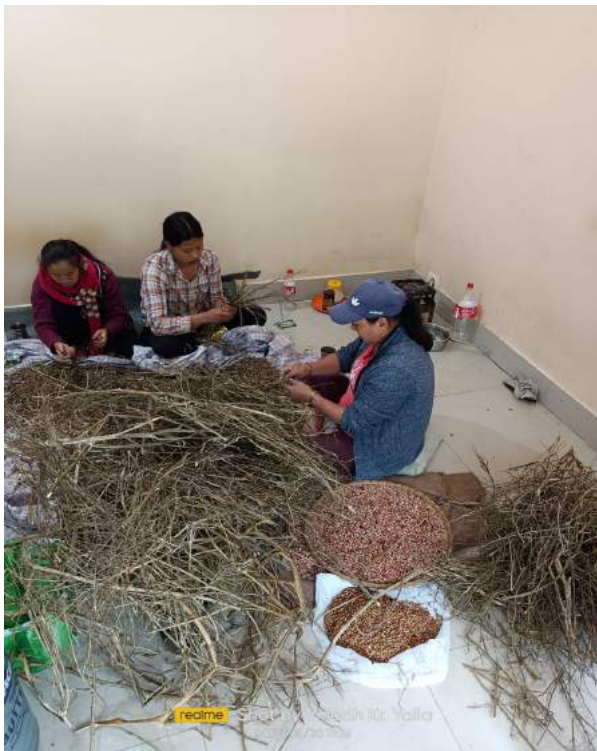
realme