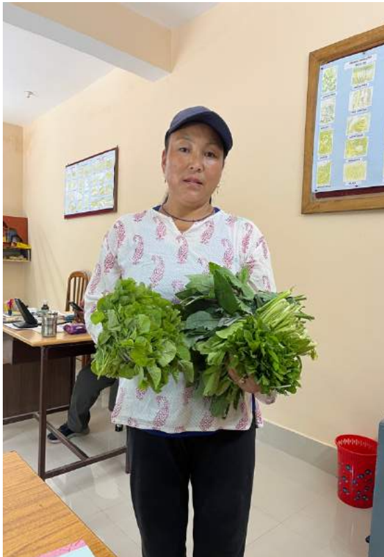
Green vegetable Mix