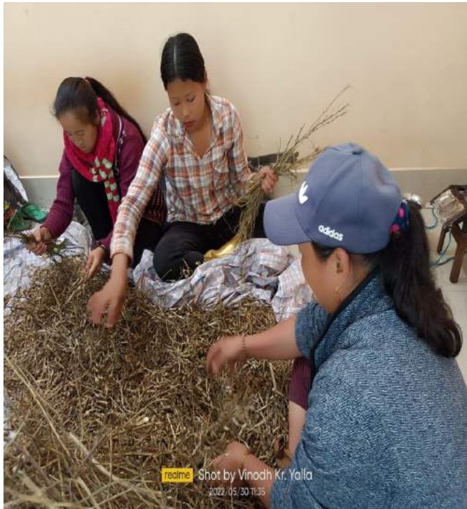
realme Shot by Vinodh Kr. Yalla 2022/05/30 11:35